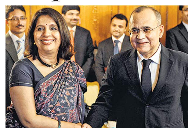
Foreign secretary Nirupama Rao greets her Pakistani counterpart Salman Bashir in Islamabad last month