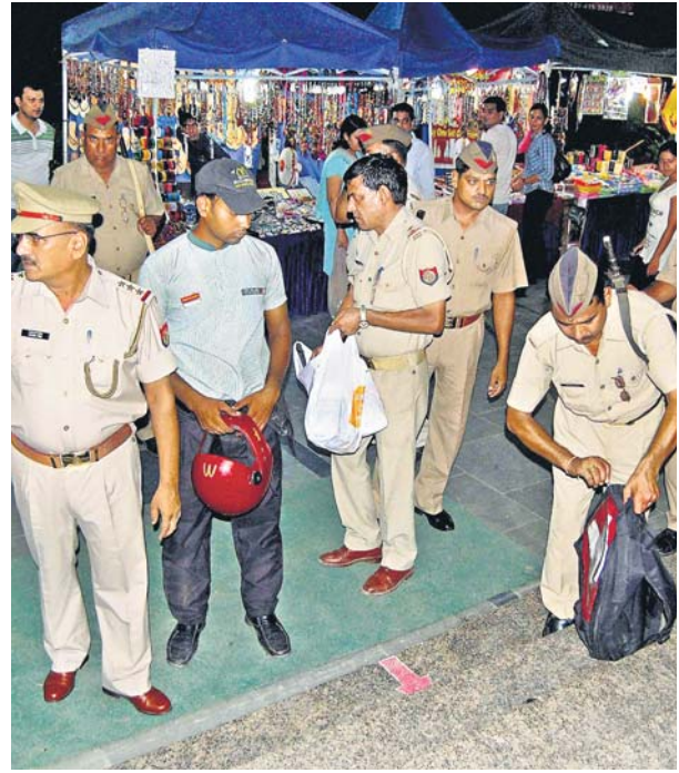
Close eye: Police check belongings of shoppers after a security alert was sounded in Noida on Wednesday

India has seen numerous blasts in its major cities since the dawn of the century, which have claimed hundreds of lives and left others with scars that don't heal. People have a perennial fear every time they step out of home